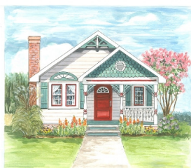
The Trumpeter Cottage 3 Bedroom 2 Bath 1440 Square Feet Single Level