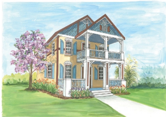
Misty's Run 4 Bedroom 3 Bath 2392 Square Feet