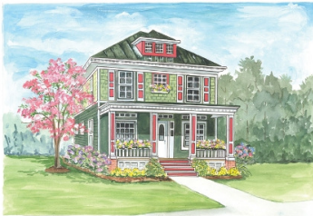
The Skipjack 3 Bedroom 2.5 Bath 2016 Square Feet