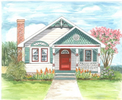
The Trumpeter Cottage

After building custom homes for over 30 years, we are extremely confident in our building methods and techniques. We have developed long lasting relationships with our suppliers and tradesman to maintain a quality construction process only found through experience.