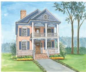
Dolphin Bay 3 Bedroom 2 Bath 2184 Square Feet